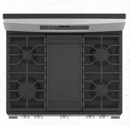
Gas Range with Self-Cleaning Convection Oven and Air Fry